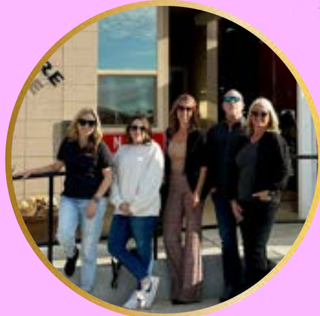
Team from Mercury Insurance visiting Paradise